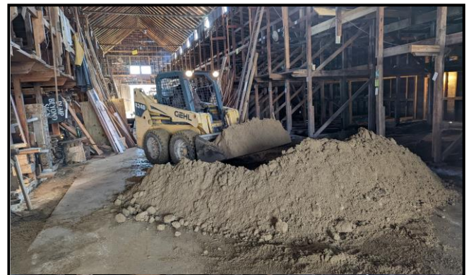
More than 60 yards of sand is only a start