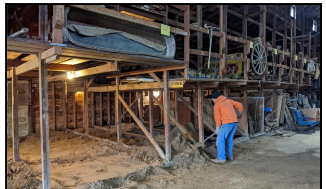
Lawrence shoveling sand to fill in the foundation walls in preparation for pouring concrete.