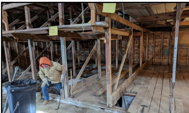
With the stock of lumber cleaned out, Lawrence Iseler is working on required repairs and modifications to the structure and foundation.